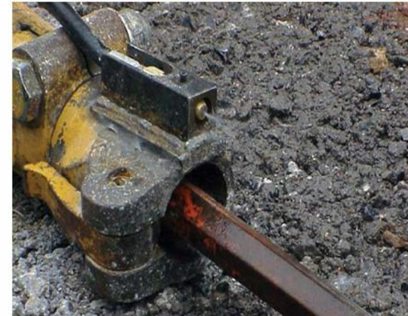
Figure 1. The water spray attachment, showing the method used to attach the nozzle to the tool.