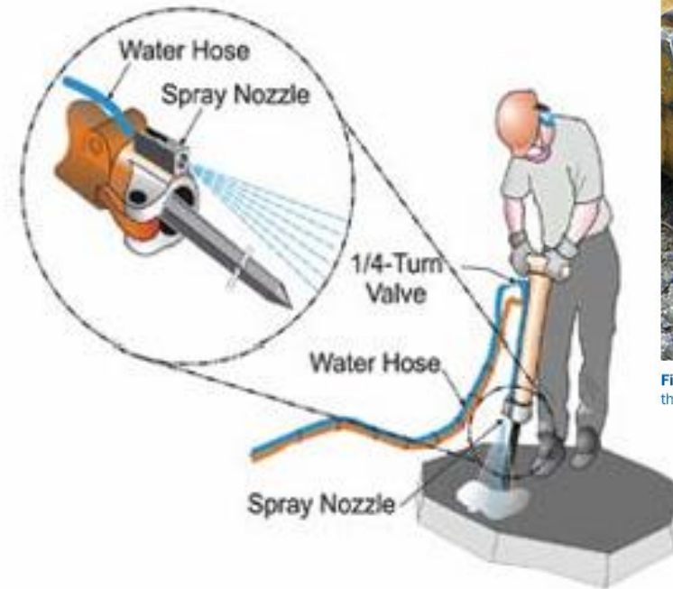
Figure 2. Diagram of water-spray control used in NIOSH study