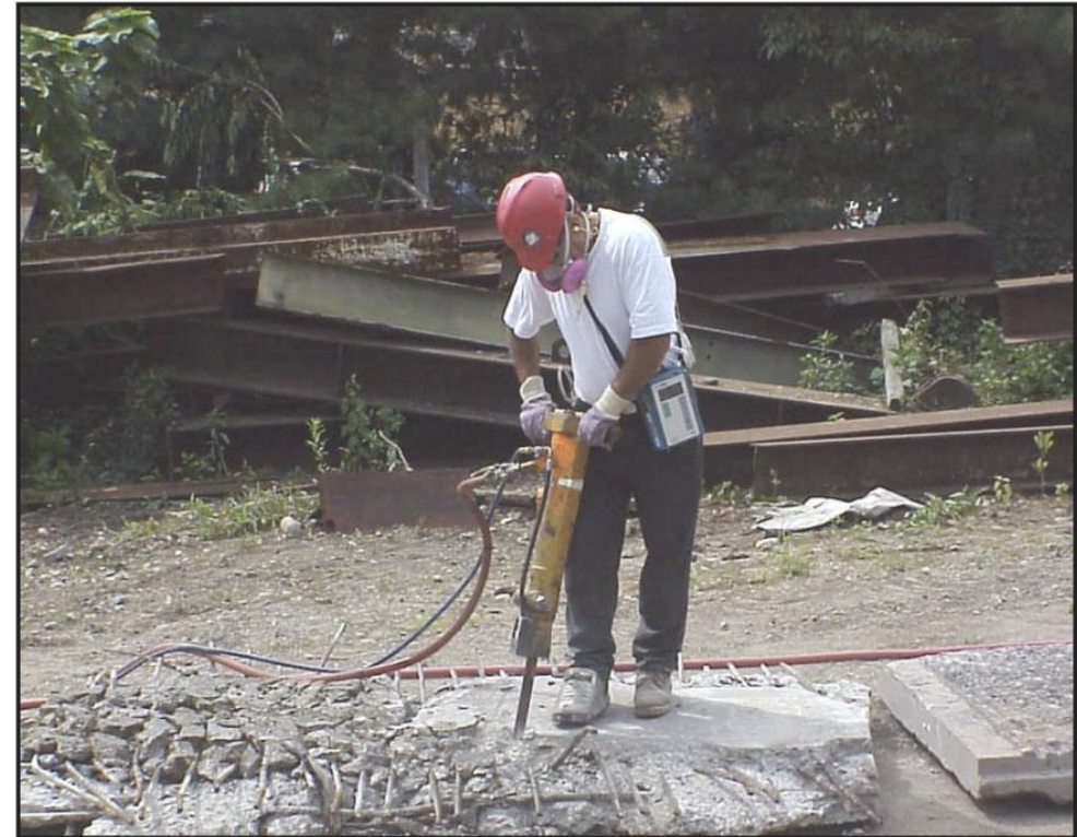
A worker chips concrete with a jackhammer using a water-spray attachment to control dust.